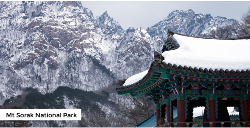
Mt Sorak National Park