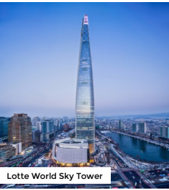
Lotte World Sky Tower